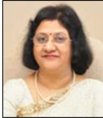
Smt. Arundhati Bhattacharya Chairman